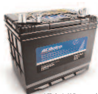
ACDelco's 60 Series model provides ample starting power.

are RC (reserve capacity minutes) and AH (amp hours). The RC rating is more accurate when the battery is used for high amp-draw devices such as trolling motors and windlasses. The AH rating gives a clearer picture of how long a battery can carry lighter loads, such as when it is used as a