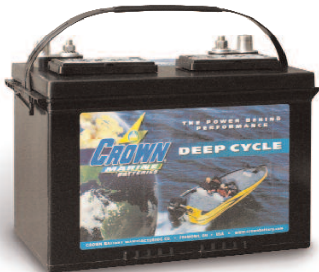
Crown Battery's deep-cycle Group 27 battery offers 170 reserve capacity minutes and 115 amp hours.

We can see proof of this in our battery chart by comparing the manufacturer's AH and RC numbers. For example, Trojan's